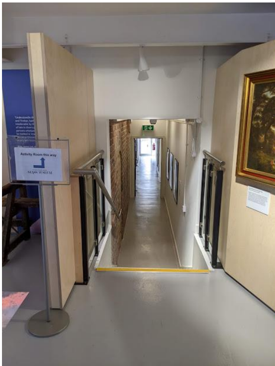
This is a picture of the staircase to the Activity Room.