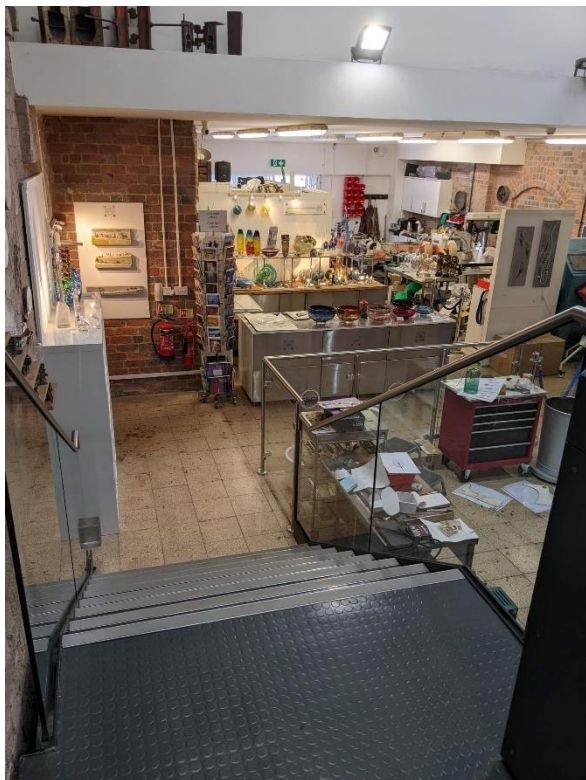
This is a picture of the staircase to the Hot Shop.